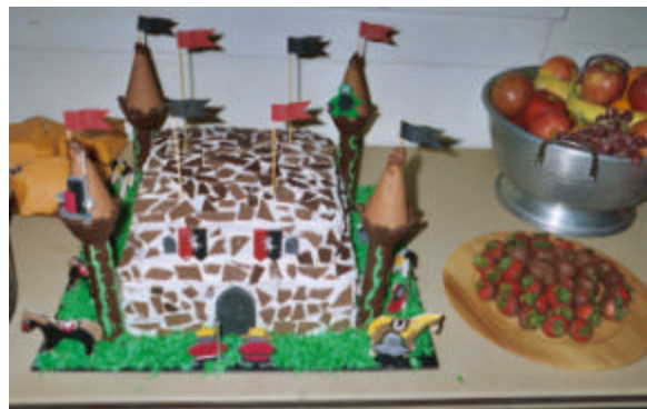
The Castle Cake and Other Desserts