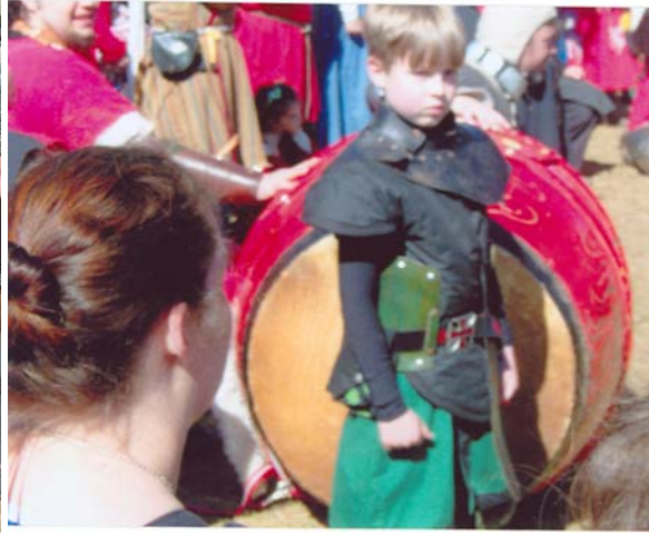
I'll be a knight when I am bigger than the drum.