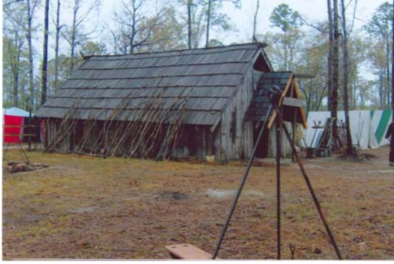
The Viking Longhouse in the Early Period encampment