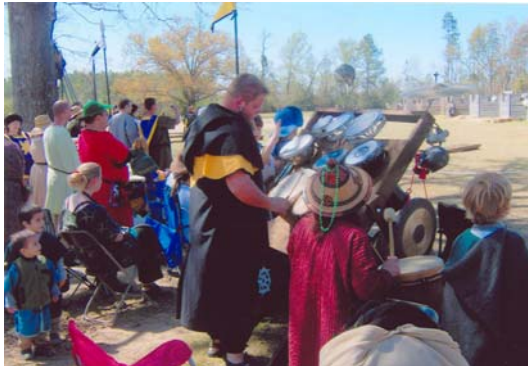
Drumming the battles at Gulf Wars XVI