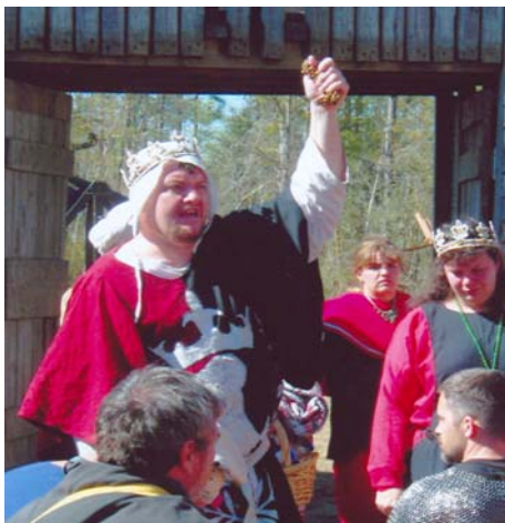
The King holds the chain of Knighthood. The Twins observe Luther's elevation announcement.