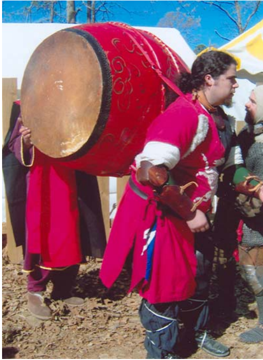
The great drum of war.