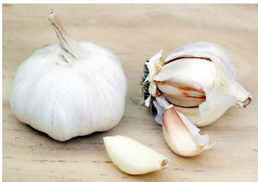
Garlic bulbs and individual cloves, one peeled