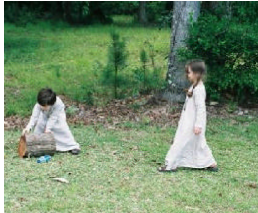
Our Future at Forest Maiden V