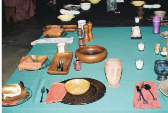
Table Setting at Forest Maiden V