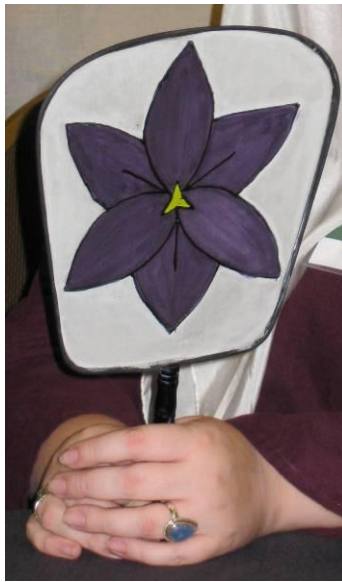
A heraldic fan at KWSS