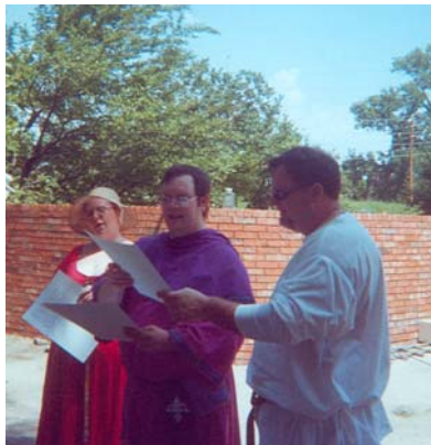
The Shire Champion revealed!