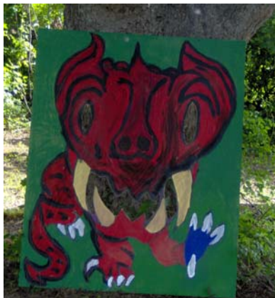
The Dragon goes to terrorize Vogelburg.