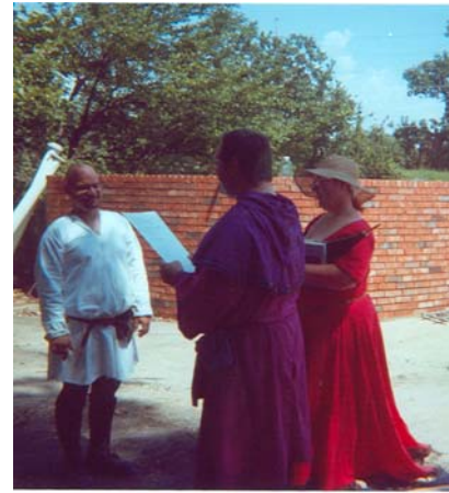
Autocrat thanked by the Oracle!