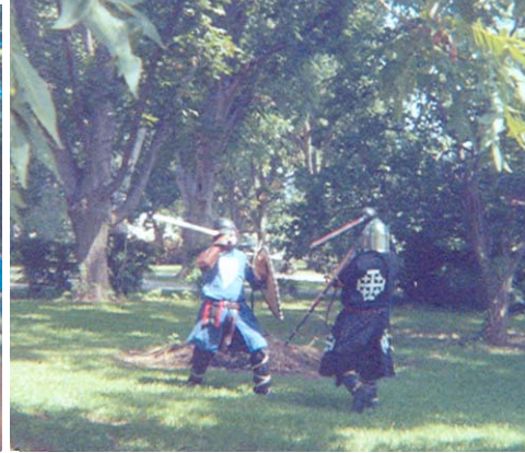
Crowd and Dragon watches at the Splendid Spectacle of Summer. Finals of the Oracle's Champion Tourney.