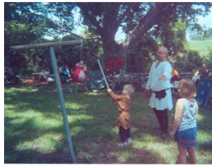
Children attack piñata of Skittles!